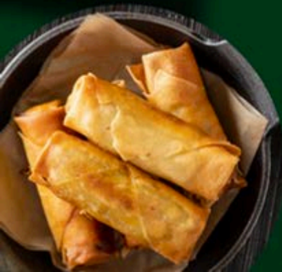
Thai Spring Roll (4)(v) ปอเปี๊ยะไส้ผัก 10- Classic Vegetable Spring Roll w/ Thai Sweet Chilli Sauce