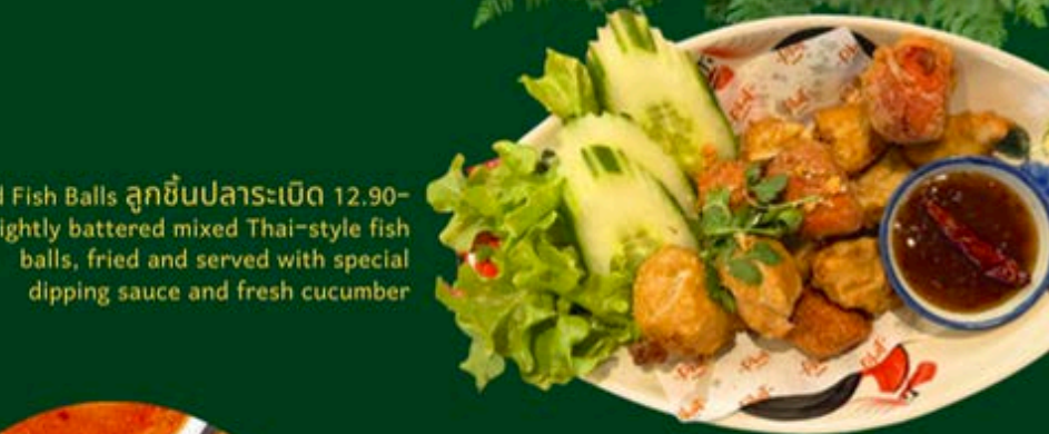
Fried Fish Balls ลูกชิ้นปลาระเบิด 12.90- Lightly battered mixed Thai-style fish balls, fried and served with special dipping sauce and fresh cucumber