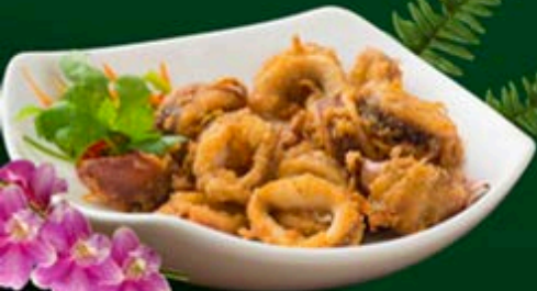
Crispy Calamari ปลาหมึกทอด 14.9- Tender calamari in light batter, fried to perfection served w/ Sriracha Aioli