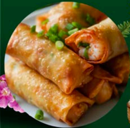
Thai Seafood Spring Roll (4) (gf) ปอเปี๊ยะทะเล 12- Crispy Spring Roll filled with crab meat & prawn served w/ Thai Sweet Chilli Sauce