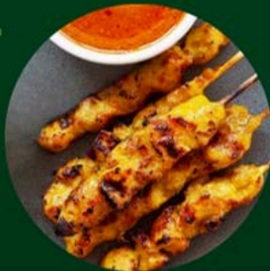
Chicken Satay Skewer (5) ไก่สะเต๊ะ 12.9- Tender marinated chicken skewer w/ our famous satay peanut sauce