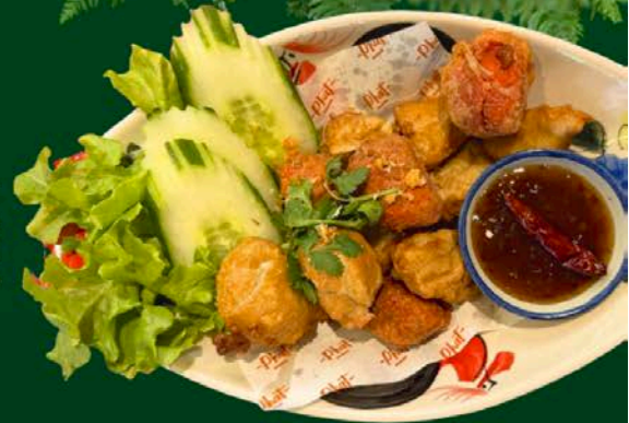
Fried Fish Balls ลูกชิ้นปลาระเบิด 12.90- Lightly battered mixed Thai-style fish balls, fried and served with special dipping sauce and fresh cucumber