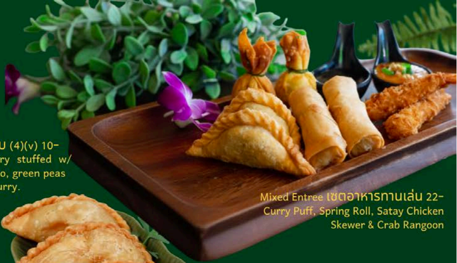
Mixed Entree เซตอาหารทานเล่น 22- Curry Puff, Spring Roll, Satay Chicken Skewer & Crab Rangoon