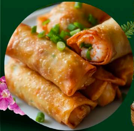
Thai Seafood Spring Roll (4) (gf) ปอเปี๊ยะทะเล 12- Crispy Spring Roll filled with crab meat & prawn served w/ Thai Sweet Chilli Sauce