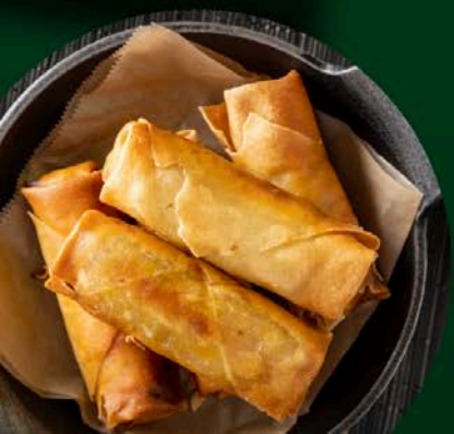
Thai Spring Roll (4)(v) ปอเปี๊ยะไส้ผัก 10- Classic Vegetable Spring Roll w/ Thai Sweet Chilli Sauce