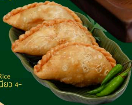
Curry Puff กะหรี่ปั๊บ (4)(v) 10- Golden flaky pastry stuffed w/ mildly spiced potato, green peas & vegetable Thai curry.