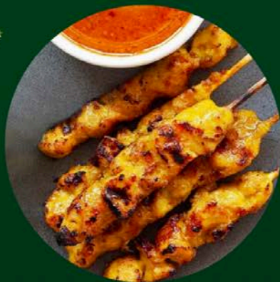
Chicken Satay Skewer (5) ไก่สะเต๊ะ 12.9- Tender marinated chicken skewer w/ our famous satay peanut sauce